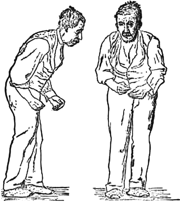
Figure 1 A case of Parkinson's disease as described and illustrated by William Gowers: "... the aspect of the patient is very characteristic. The head is bent forward, and the expression of the face is anxious and fixed, unchanged by any play of emotion. The arms are slightly flexed at all joints from muscular rigidity, and (the hands especially) are in constant rhythmical movement, which continues when the limbs are at rest so far as the will is concerned. The tremor is usually more marked on one side than on the other. Voluntary movements are performed slowly and with little power. The patient often walks with short quick steps, leaning forward as if about to run (61)."

display small and cramped handwriting which becomes progressively smaller (micrographia) with a tendency of the sentence to fall off the line.